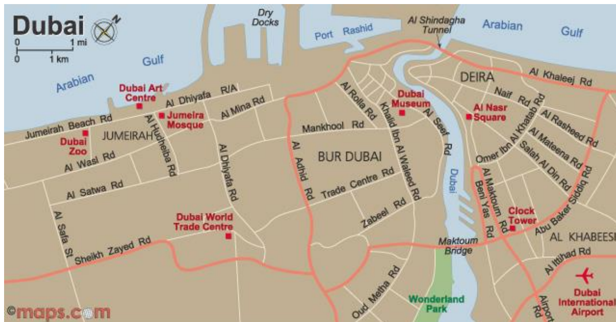
Figure 1: Dubai Map (Google Maps, 2013)

This project aims at examining the tourism features available in Dubai. Dubai, is a well established tourist destination with a number of luxury hotels and leisure activities. It is one of the seven emirates of UAE and has a harbour in the Arabian gulf making it one of the vital Middle East trade centres. The following figure identifies the map of Dubai. This report will first examine the different types of tourism features in Dubai, the motivation for tourism in Dubai, the tourism industry and the promotion of tourism.