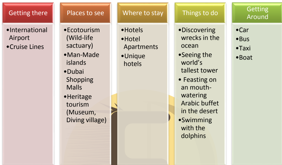
Figure 3: Preparing Tourism Brochure